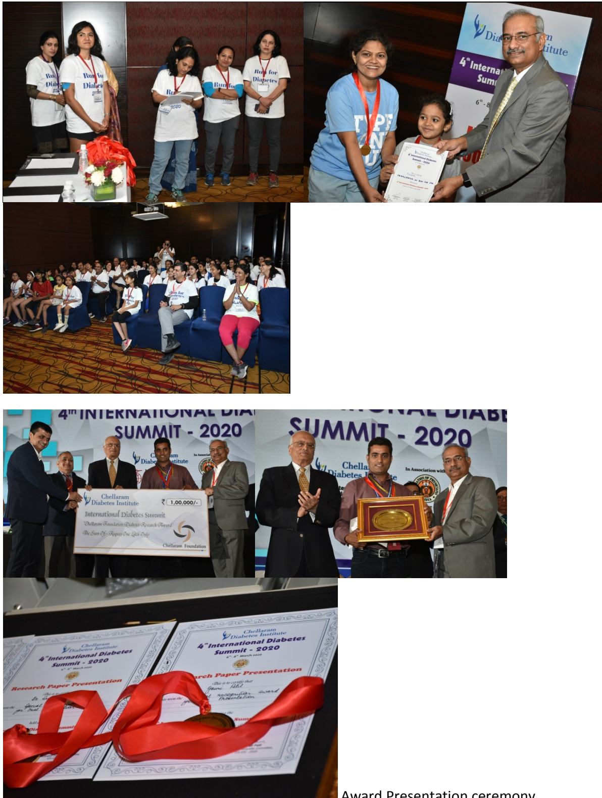
Award Presentation ceremony