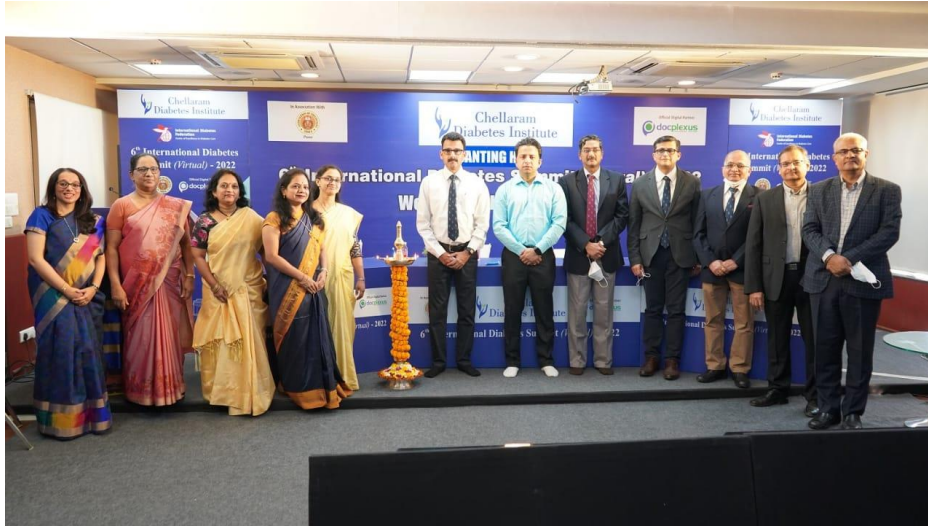
A physical lamp lighting was done on 1 st day before the sessions.